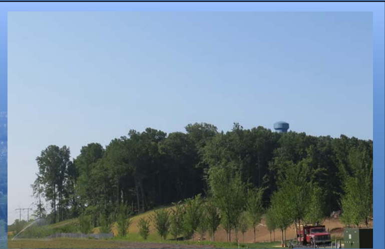
View of Proposed Tank from River Heritage Boulevard and Dominican Drive