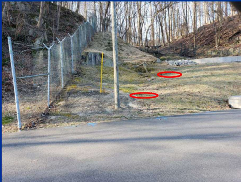
Raise Bore Operations Raise Boring